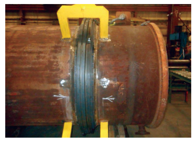
BADGER has a long history of manufacturing new ASME Code expansion joints for many heat exchanger OEMs and refurbishing existing expansion joints for end users

ASME qualified welders, are typically made with SA and SB material. The convolutions may be U-shaped or toroidal depending on design conditions and size of the bellows.