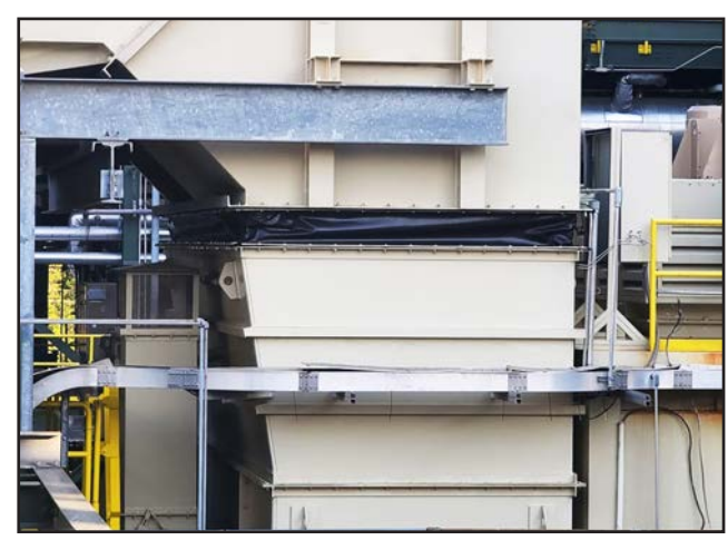
Badger's air inlet duct expansion joints eliminate the costly OEM zipper closure