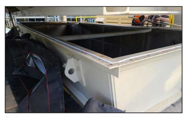
Badger's turnkey replacement service includes removing the existing fabric expansion joint, hardware assemblies, and backing bars