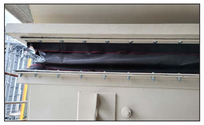
A new composite fabric expansion joint is installed with PTFE flange gaskets, new hardware assemblies, and the previously removed backing bars